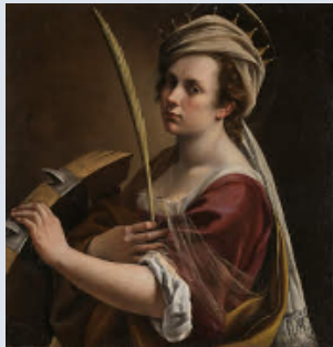
Self Portrait as St. Catherine, Artemisia Gentileschi c: 1616

We could also discuss current exhibitions at galleries around the world.