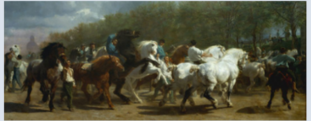
The Horse Fair 1855, 8' x 16', Rosa Bonheur