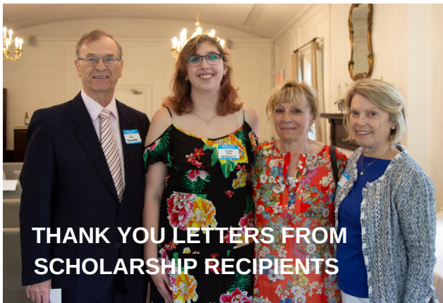
THANK YOU LETTERS FROM SCHOLARSHIP RECIPIENTS