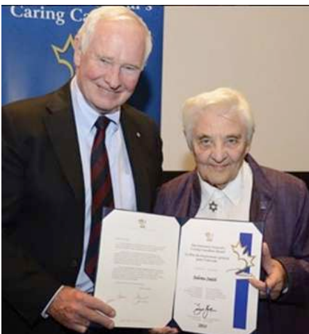
Photo with former Governor General of Canada David Johnson