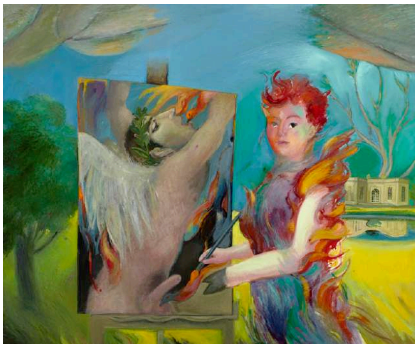
Photo: Artist on Fire by Joyce Wieland

We will meet at the historic Heliconian Hall, 35 Hazelton Avenue, Toronto, (Bay subway). Events begin at 7:30 p.m. (doors open at 7:00 p.m.) Light refreshments are included. Cash bar is available.